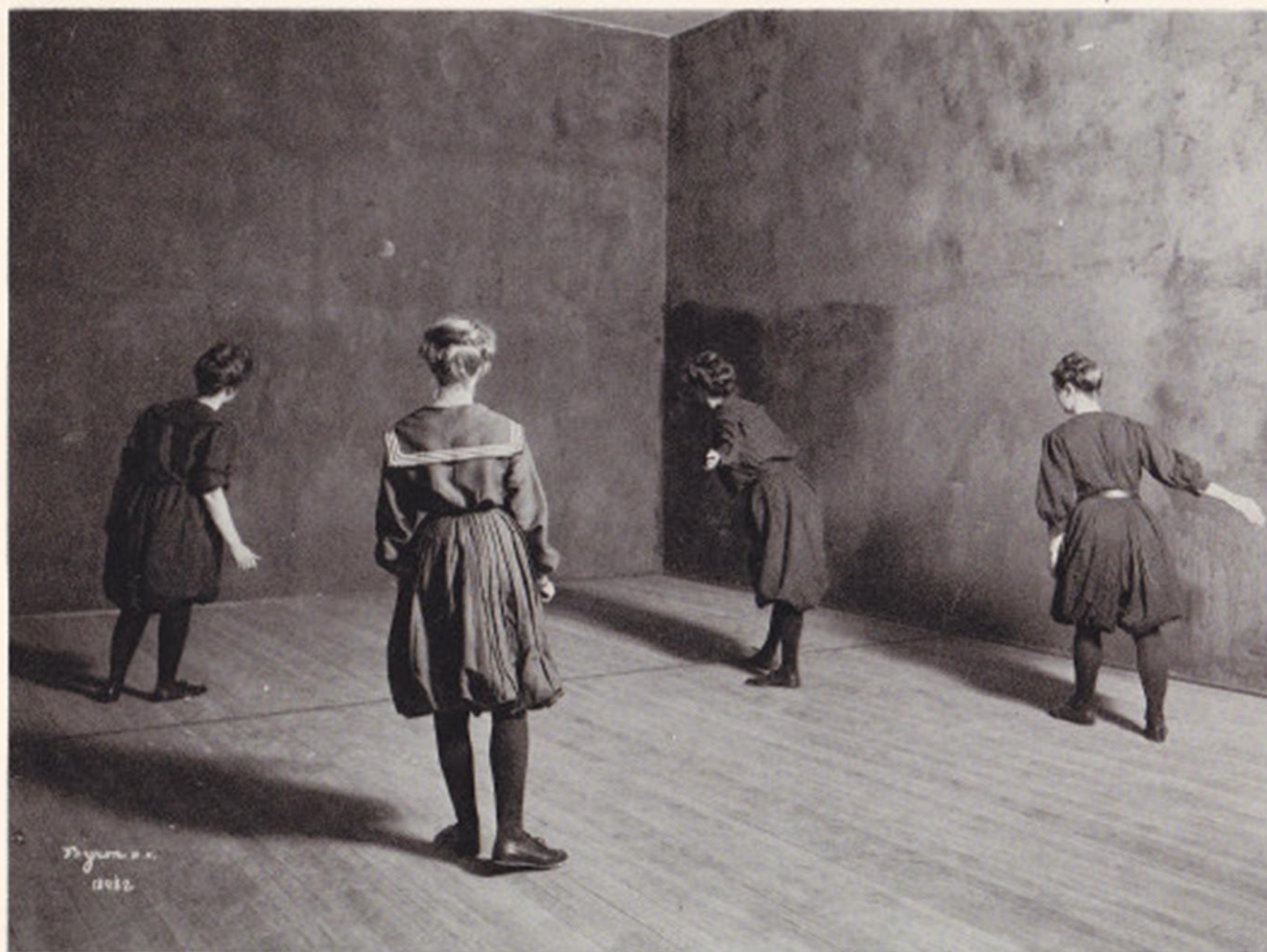
Action at Teachers College, New York City circa 1904